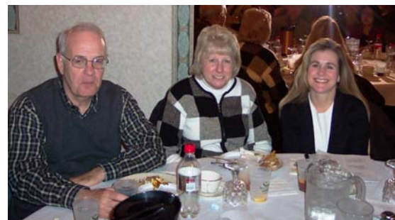
Baltimore Chapter Members stop for a picture during the break